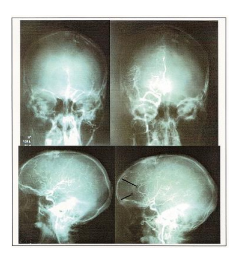
Figure 2: Cerebral conventional angiography yielding lack of perfusion in the left ACA territory (top and bottom left) and a normal perfusion in the right ACA territory (top and bottom right). The long and short arrows point out the pericallosal and cinqulate sulcus arteries, respectively.

Unusually prolonged infarction in the ACA territory, unrelated to subara-