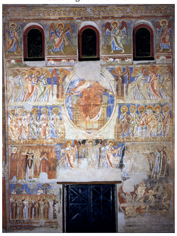
Figure 2 – Last Judgment, ca. 1080. Basilica of San Michele, Sant'Angelo in Formis.