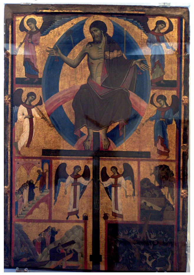
Figure 6 – Guido da Siena and followers. Last Judgment , end of the 13<sup>th</sup> century. Tempera on panel, 105 x 210 cm. Museo Archeologico e d'Arte della Maremma, Grosseto.