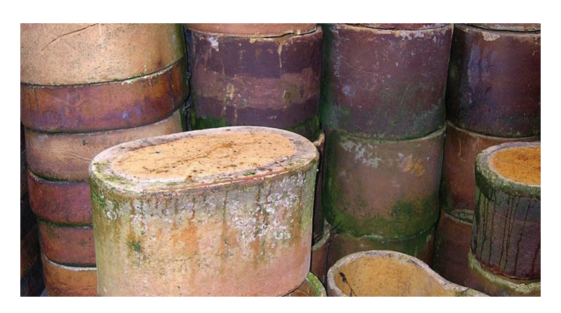
Fig. 5. Saggars, cylindrical clay boxes for the pottery production.

the tradition of red-slip in the production of ceramics from Africa can be highlighted through its cooking tools, the so-called saggars. Saggars are cylindrical boxes of clay, mouth wide at one end and narrow at the other, in which the pottery must be placed to be cooked. Comparison with techniques used in modern earthenware workshops suggests that saggars were stacked on top of one another, forming towers in the kiln. The only saggars so far excavated in Oudhna indicates that within a saggar there was room for about 12 lamps, and that about 180 saggars could be placed inside an oven, giving a total charge of burning of more than 2000 pieces.