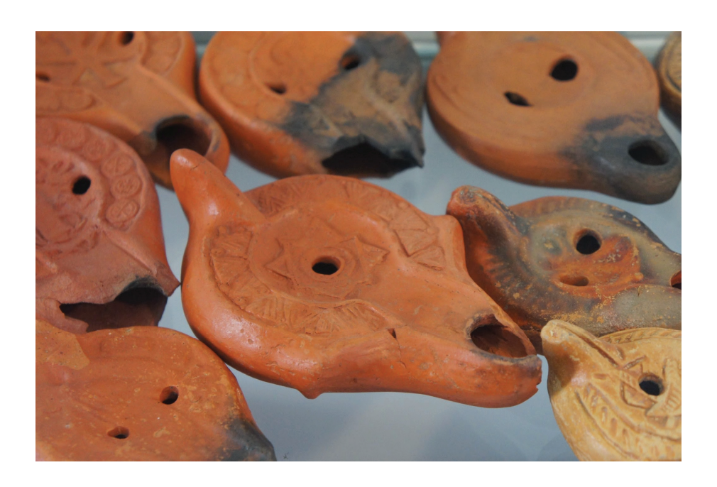
Fig. 4. Jewish and Christian iconography in ARS clay oil lamps.

region of Carthage regained its hegemony in production and trade throughout the middle of the 5th century CE. In Nabeul (Neapolis) were found oil lamps in a fish salting factory presenting a continuous stratigraphy of the 1st to the 7th centuries CE. Finally, in Rougga (Bararus) the lamps were found in the reoccupation of the forum, corresponding to levels that cover the period between the 7th – 8th centuries CE.