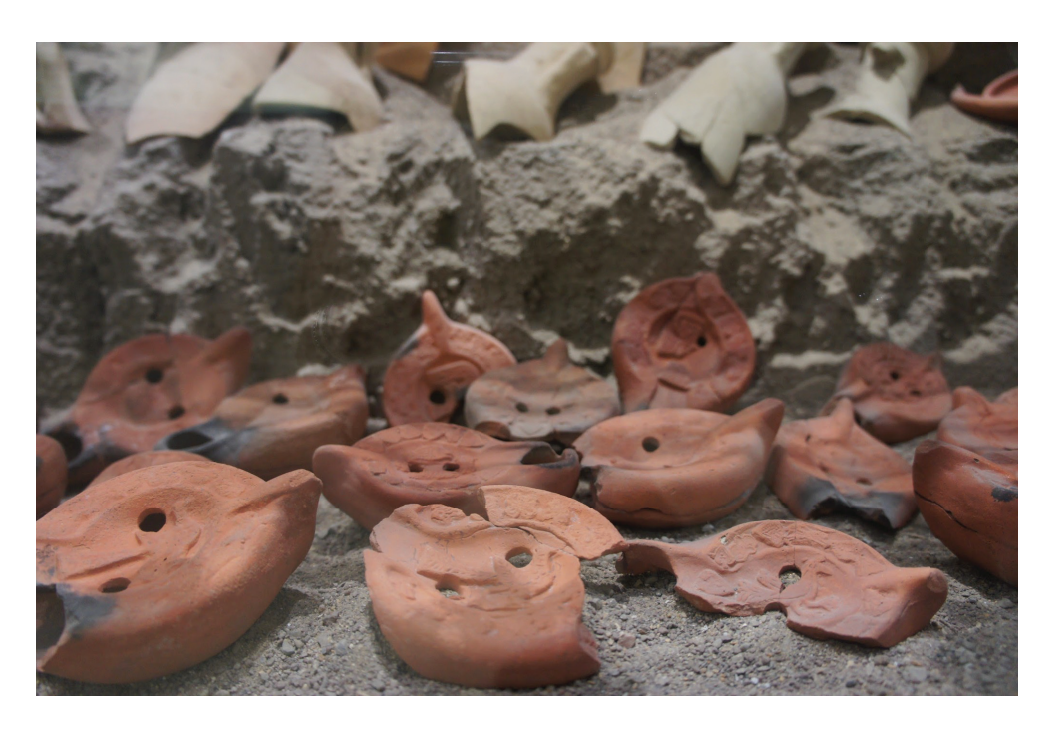
Fig. 3. North African red-slip clay oil lamps.

his efforts in three neighboring towns of the Pupput necropolis, Sidi Jdid and Nabeul (in the northern Gulf of Hammamet) and the site of Rougga-Bararus (near El Jem). During the excavation of the urban necropolis in Pupput (Hammamet) in activity during the 2nd to 4th centuries CE, about 600 clay lamps (African Red Slip) were found. In Sidi Jdidi (Aradi) the lamps were found related to the illumination of three Christian basilicas, dating between the 5th and 7th centuries CE.