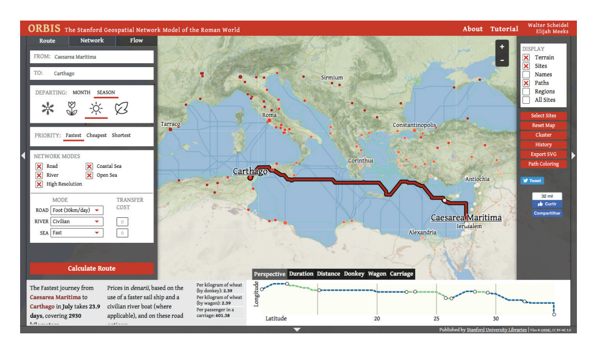
Fig. 1. Projection of the route between Caesarea Maritima and Carthage using the ORBIS – Geospatial Network Model of the Roman World.

accumulates a set of data that allows generating inferences and exploring the cost of mobility throughout the domains of the Roman Empire. Another highlighted project is the Pelagios <sup>3</sup>, which provides a set of features that allow the design of data in dynamic maps dedicated to different historical periods. These maps are open source and free for use in research, teaching and / or general interest.