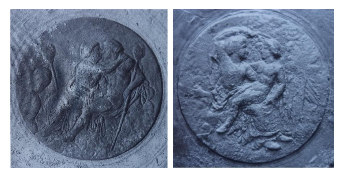
Fig. 9a-b. Dionysus and Ariadne (left). Aphrodite and Eros (right): Dual bronze mirror with cover decorated in relief. Produced in Chalcis. Found in Eretria. Athens, National Museum, 7670 e 7670a. Last quarter of 5<sup>th</sup> century B.C.

seated upon a panther hide on a rocky base, extending his hand to the goddess<sup>21</sup>.