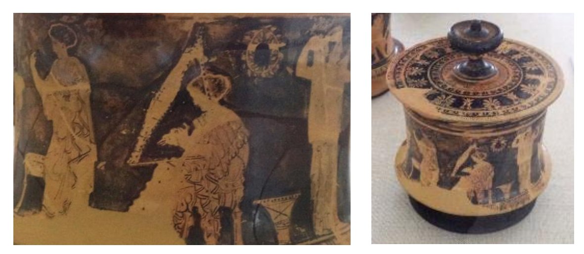
Fig. 5. Attic red-figure pyxis with gunaikaion scene. The Washing Painter. Würzburg, Martin von Wagner Museum, 541.

initiation, compatible with some ritual related to Eros, a concept that becomes fairly common in the iconography of Apulian vases in the second half of the fourth century B.C. (Schneider-Herrmann 1977: 29, 38; 1970).