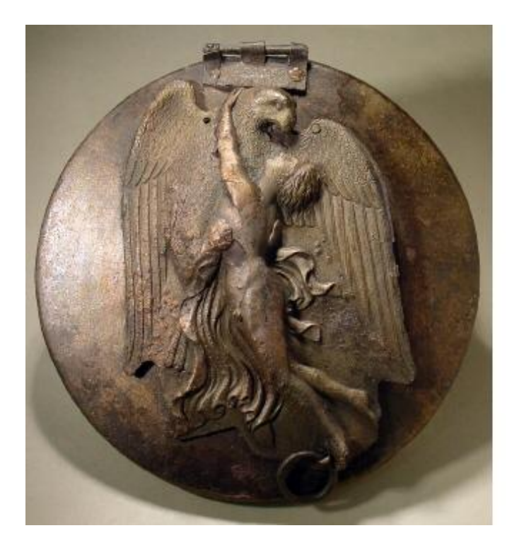
Fig. 8. Zeus (eagle) and Ganymede: Box mirror with cover decorated in relief. Bronze. Produced in Chalcis. Berlin, Antikensammlung, 7928. c. 360-350 a.C. (Züchner).

would be fairly paradoxical, given the presupposed feminine supremacy in the "world of the mirror".