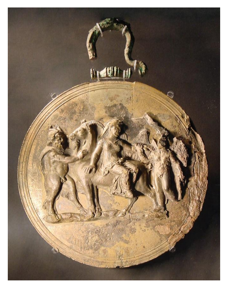
Fig. 13. Aphrodite Epitragia (on a female goat), between Pan and Eros: Box mirror with relief. Bronze. Berlin, Antikesammlung, 8393. Corinth, Eretria (?), c. 375.

A variation of the theme of Aphrodite Epitragia with a goat can be found on a mirror made in Corinth and found in Eretria, which is kept at the Antikensammlung in Berlin (Züchner, 1942, 10, KS 7). It represents the goddess riding a female goat between Eros and Pan (Fig. 13), once again moving towards the realm of Dionysus, a domain of uncontrollable desire.