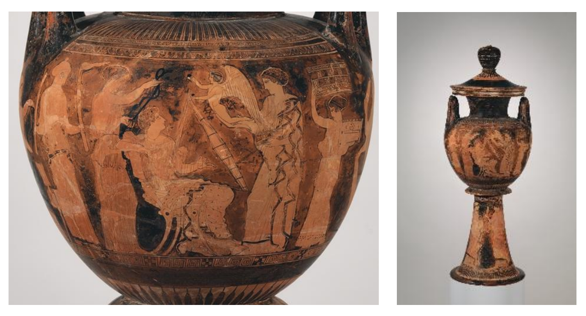
Fig. 4. Attic red-figure lebes gamikos : The Washing Painter. New York, Metropolitan Museum of Art, 16.73.

able to identify the rarity of the mirror. One of the few exceptions occurs on a hydria by the Kleophon Painter (Vergara Cerqueira 2001: cat. 312)<sup>13</sup>.