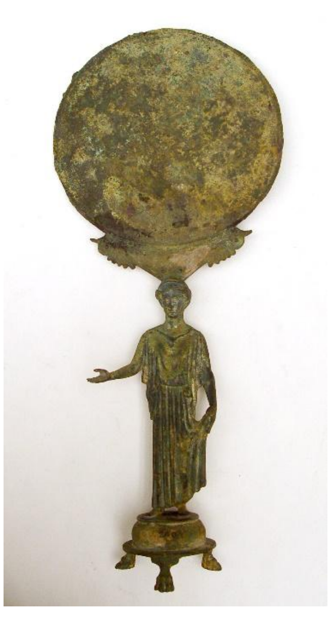
Fig. 1 . Table mirror with caryatid stand: Originally the female figure had a dove in her right hand. London, British Museum, inv. 1873,0820.235. Production: Argos. Origin: Athens. c. 460 B.C.

The mirror is one of the most prominent products of Greek metalwork. They were bearers of ornamental refinement from the late sixth century B.C. as exemplified by the standing mirrors with caryatid-shaped handles or stands (Fig. 1). Mirrors are objects that are present in both the material registry (mainly funerary) as well as in the iconographic registry, especially in vase painting. Beyond pragmatic uses, the possible meanings associated with this object pique our interest, because "since ancient times, the mirror has fascinated the human spirit" (Kuzmina 2013: 156).