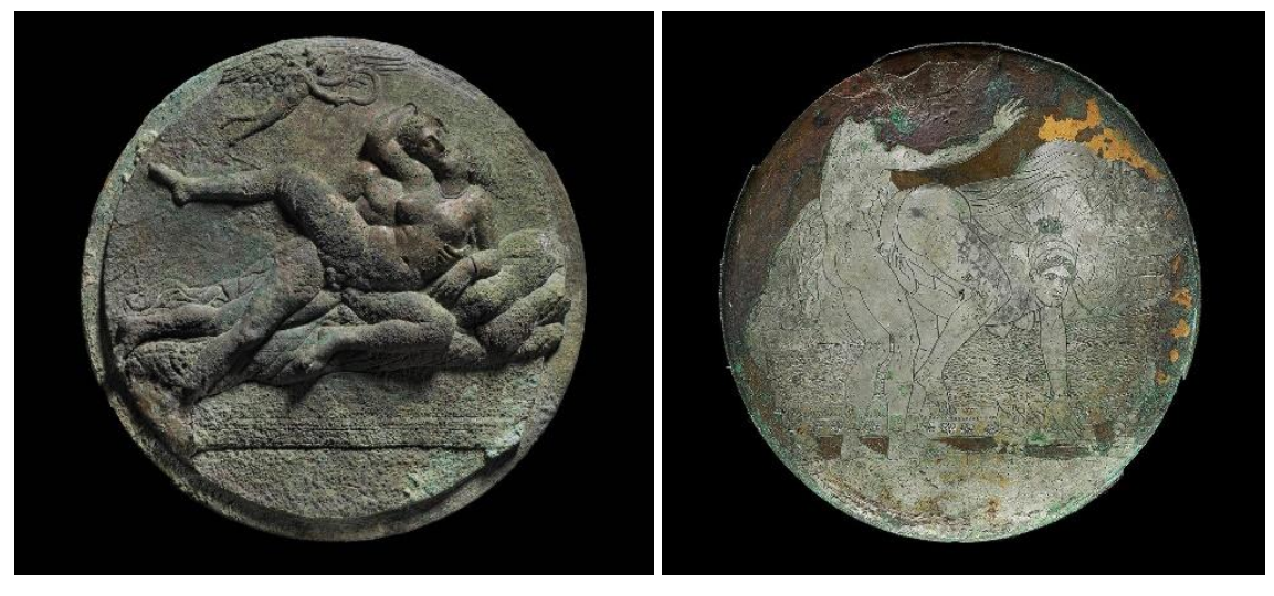
Figures 7a-b. Left: Relief: Eros and sex scene ( symplegma ). Right: Engraving: Sex scene ( symplegma ). Box mirror. Bronze. Corinth. Boston, Museum of Fine Arts, RES.08.32c.2 Ca. 340-320 a.C. (internal scene, incised)

who was active between 370 and 320 B.C. He was known in the Ancient World, for the sculptural group depicting Zeus in form of an eagle taking Ganymede away, among other works (Brodersen, Zimmermann 2006: 335). It is very probable that in the representation of the myth reproduced in this Chalcidian mirror reflect the impact of the famous work of the Athenian sculptor, being inspired from it. However, it is not easy to disassociate this theme from an apology for male homoerotic pederasty, that a priori would be fairly paradoxical, given the presupposed feminine supremacy in the "world of the mirror".