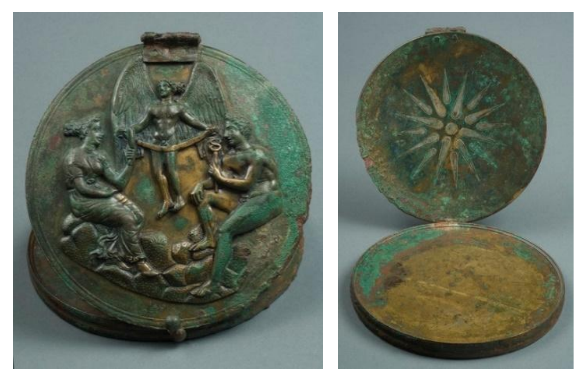
Fig. 16a-b. Aphrodite, Hermes and Eros (left). Star (right): Box mirror, in bronze, with original structure well preserved, consisting of polished disc, hinged to a lid, with engraving in inner side (star) and repoussé decoration on the cover. Produced in Corinth. Third century. Brussels, Musée du Cinquantenaire, R.1266.

The Corinthian mirror in New York shows the mirror in the mirror, indicating its use by women as a feminine personal care utensil. In this case, we probably see its use by women of high social status, "citizen-women". On an exceptionally well preserved box mirror in Brussels we see the goddess Aphrodite viewing herself in a mirror on the cover decorated in relief (Fig. 16a). This gesture indicates her attribute as the goddess of beauty. Here, Aphrodite is not only a divinity that provides love - she herself seduces with her beauty. She is in the presence of Hermes, whose love she yields to, in exchange for her sandal. They are sitting on a rocky base, suggesting consenting love, at the same time that an exuberant, adolescent Eros draws near with a ribbon, commemorating the union.