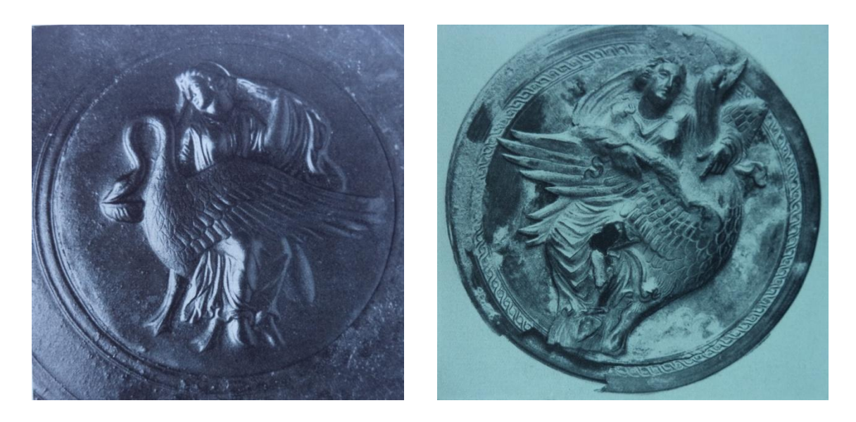
Fig. 11. (left) Aphrodite and swan: Box mirror with cover decorated in relief. Bronze. Produced in Chalcis. Athens, National Museum, 7417. Last quarter of 5th century B.C.

At the National Museum in Athens, a Chalcidian mirror from Eretreia represents one of the oldest preserved box mirrors with a cover and repoussé decoration. Here, the goddess gives a bowl of water (?) to a swan upon which she is seated (Fig. 11)<sup>27</sup>. On another mirror, the goddess flies upon a goose, as in a Corinthian example from Paris, discovered in Eretria and dating to the second quarter of the fourth century B.C. (Fig. 12). The goose reinforces the association with Dionysus highlighted above, connoting the sexual impulse.