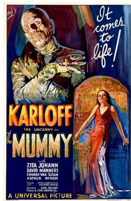
Figure 2: Film Poster of The Mummy (1932) ( https://www.imdb.com/title/tt0023245/mediaviewer/rm2286536960 ).