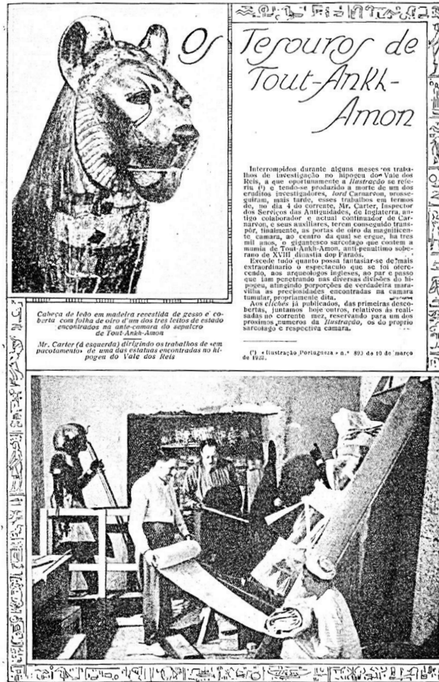
Figure 4: Ilustração Portuguesa (19.02.1924).