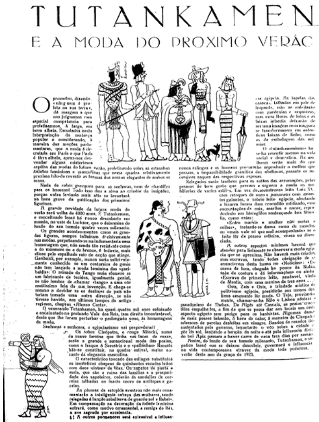
Figure 6: ABC - Revista Portuguesa (05.04.1923).

This is a clear example of the emerging Tutmania we mentioned earlier, and, in this case, its application to a fanciful ‘fashion world’.