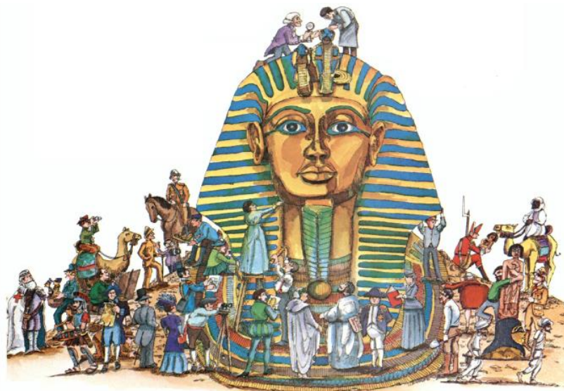
Figure 1: Allegorical representation of the interest around the Pharaoh Tutankhamun (Holt, 1986: 61).

'Tutmania' expresses all the fascination and admiration developed around Pharaoh Tutankhamun after the discovery of his tomb by Howard Carter and Lord Carnarvon on the 4 th of November of 1922. Although everything about the Pharaoh, his tomb and treasures was of great interest, it was the 'mummy's curse or revenge', particularly developed after Carnarvon's death on the 5 th of April of 1923 – truly caused by a mosquito bite that led to septicaemia –, that most motivated the development of enthusiasm and fascination for this ancient Egyptian figure and the authentic veneration from fans from all geographical quarters 14 (Lupton, 2009: 23; Day, 2006: 3; Holt, 1986: 62).