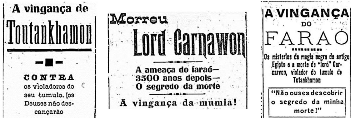
Figure 5: A Capital (11.02.1924); A Capital (05.04.1923); Diário de Notícias (07.04.1923).

The attention given to these questions reveals a standpoint that looked at the discoveries in ancient Egypt as propitiators of historical knowledge,